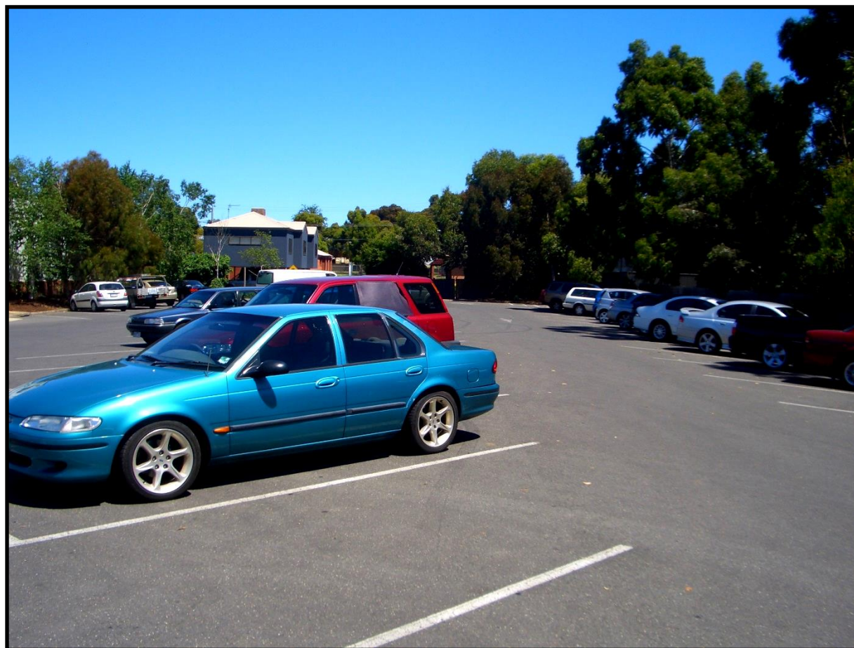
(ii) Southerly facing view of rear car park at Midvale Shopping Centre.