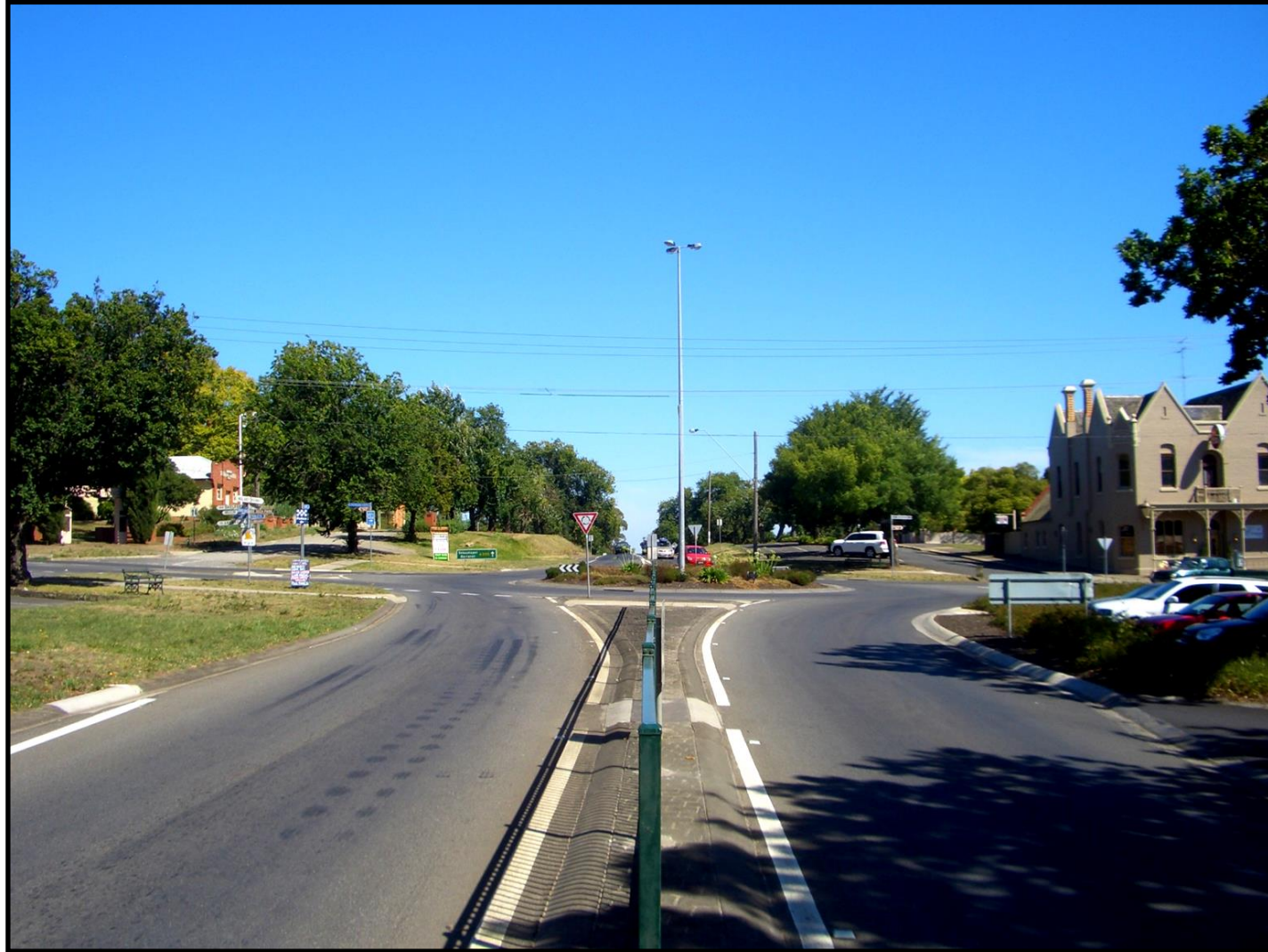
(i) View of Buninyong CBD facing west.