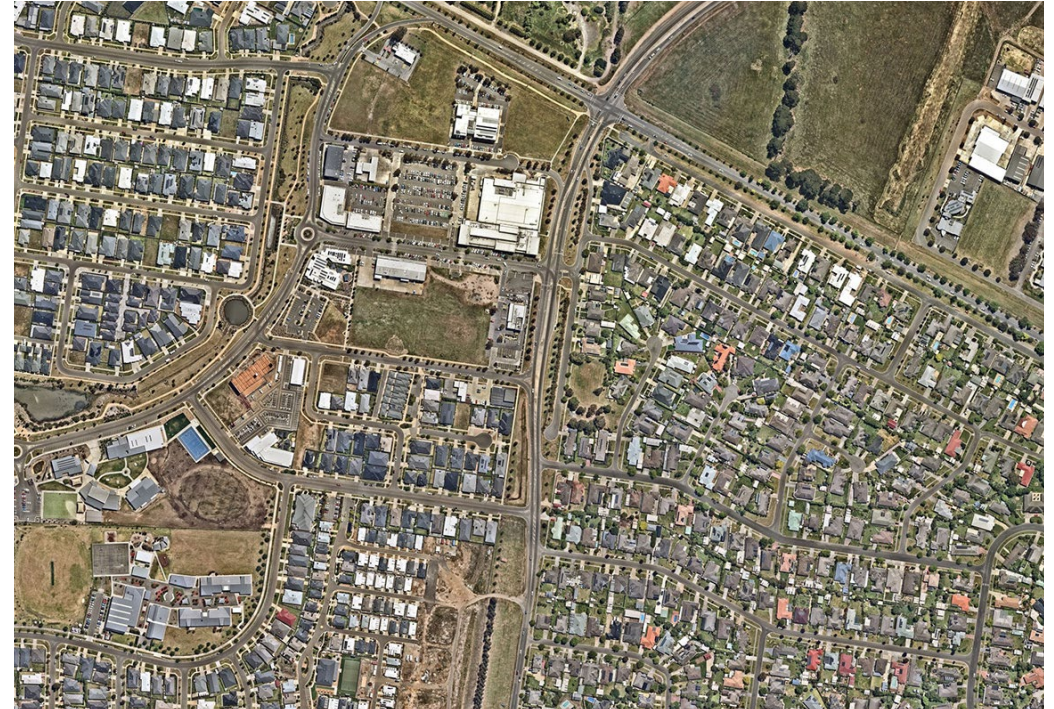
Site Aerial as of 7 November 2023

Average daily traffic on Dyson Drive increased from 6,529 in 2016 in 10,490 in 2021.