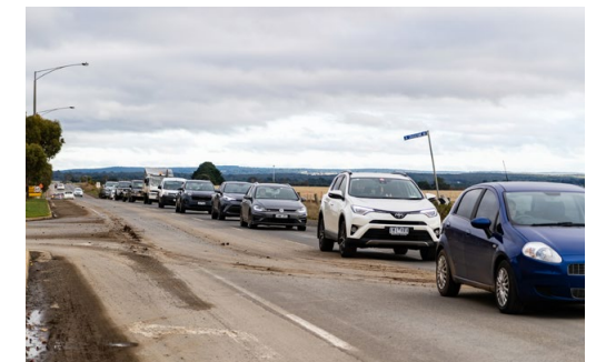
Dyson Drive Duplication continues on next page