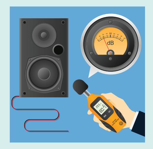
Example of a noise limiter

Noise limiters can also be ineffective or costly (sometimes requiring several limiters) for live bands. You may need other solutions to control noise emission before proposing an operation for live music.