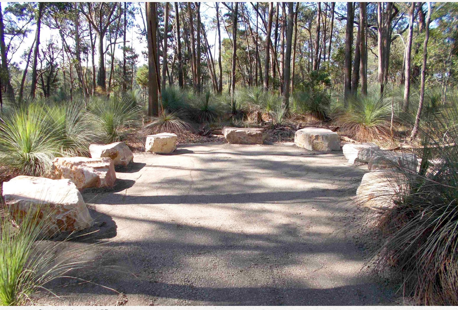
Stone circle