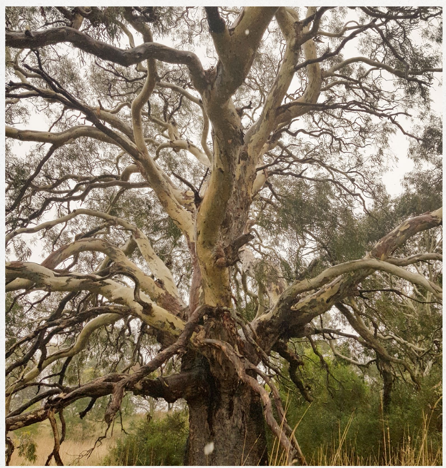
Old Tree - Image by Heath Steward c/o Susan Moodie, Black Swamp