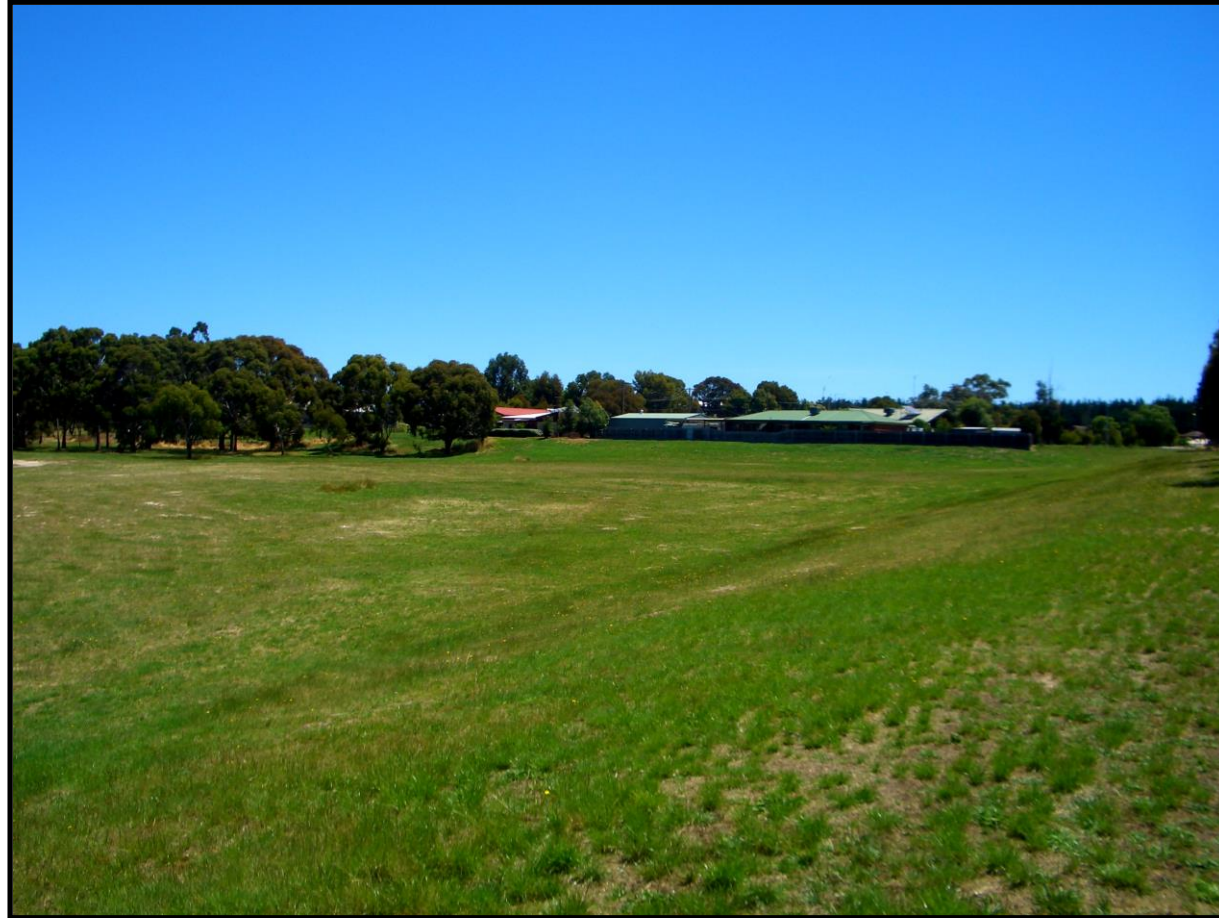
(ii) Grassed area to the south-west of Canadian Lakes Boulevard suitable for parking.