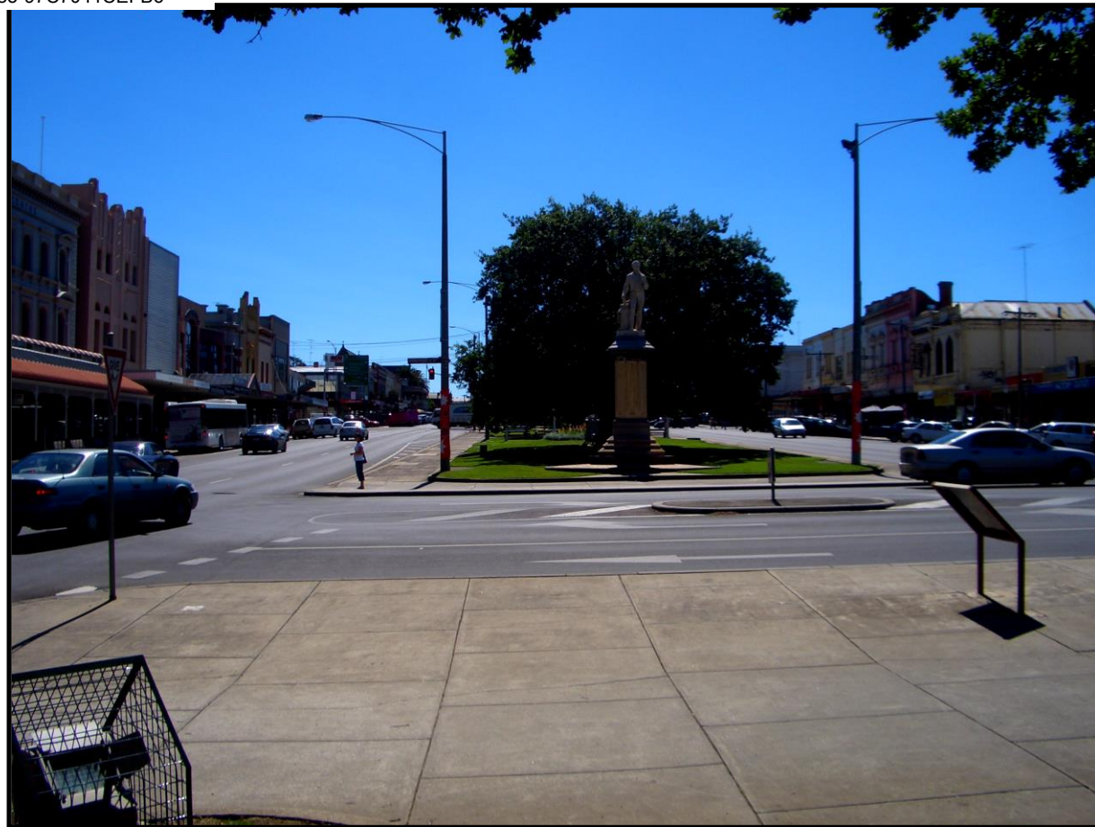
(i) Intersection of Sturt and Armstrong Streets representing the approximate centre point of the CBD Neighbourhood Safer Place.