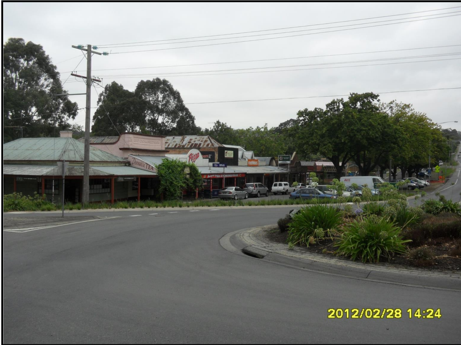
(ii) Easterly facing view of Buninyong CBD.