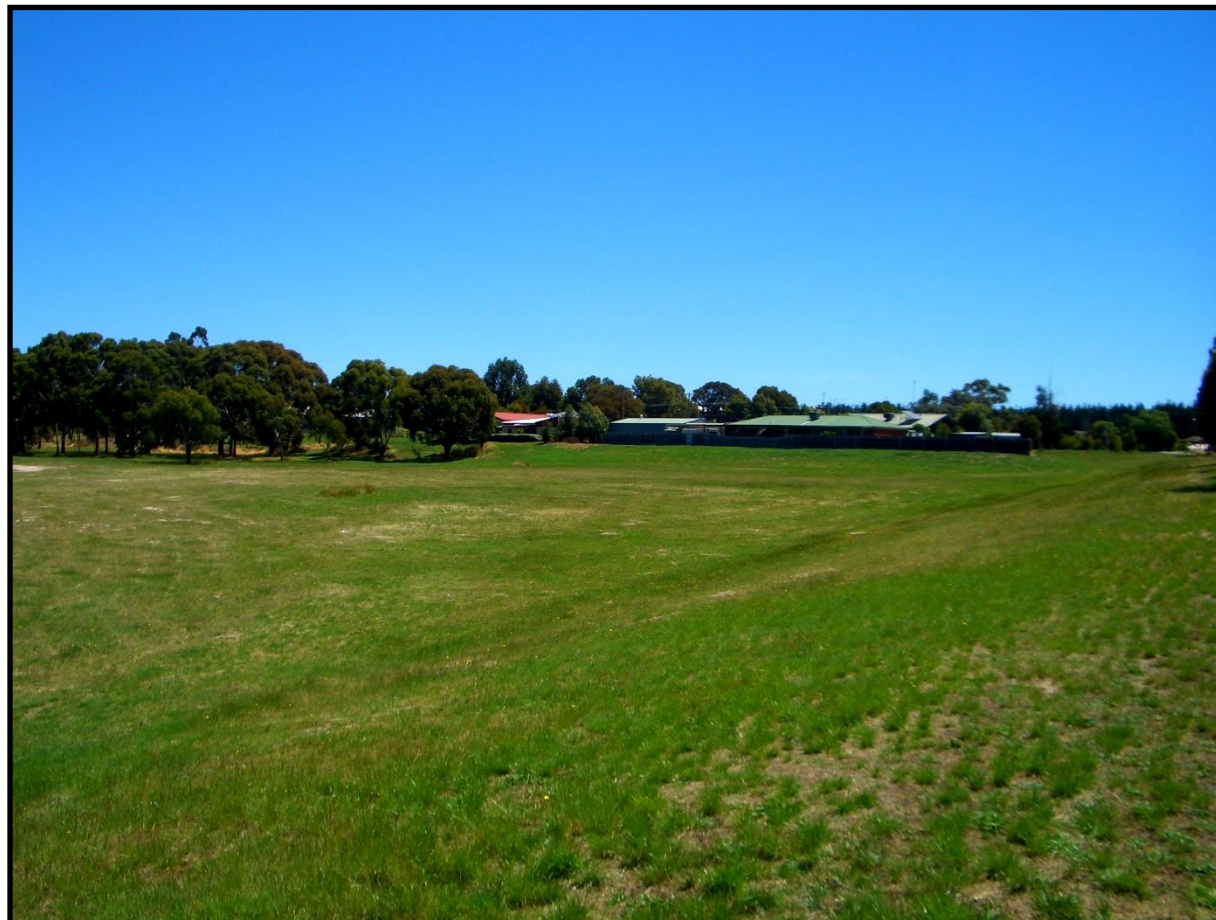
(ii) Grassed area to the south-west of Canadian Lakes Boulevard suitable for parking.