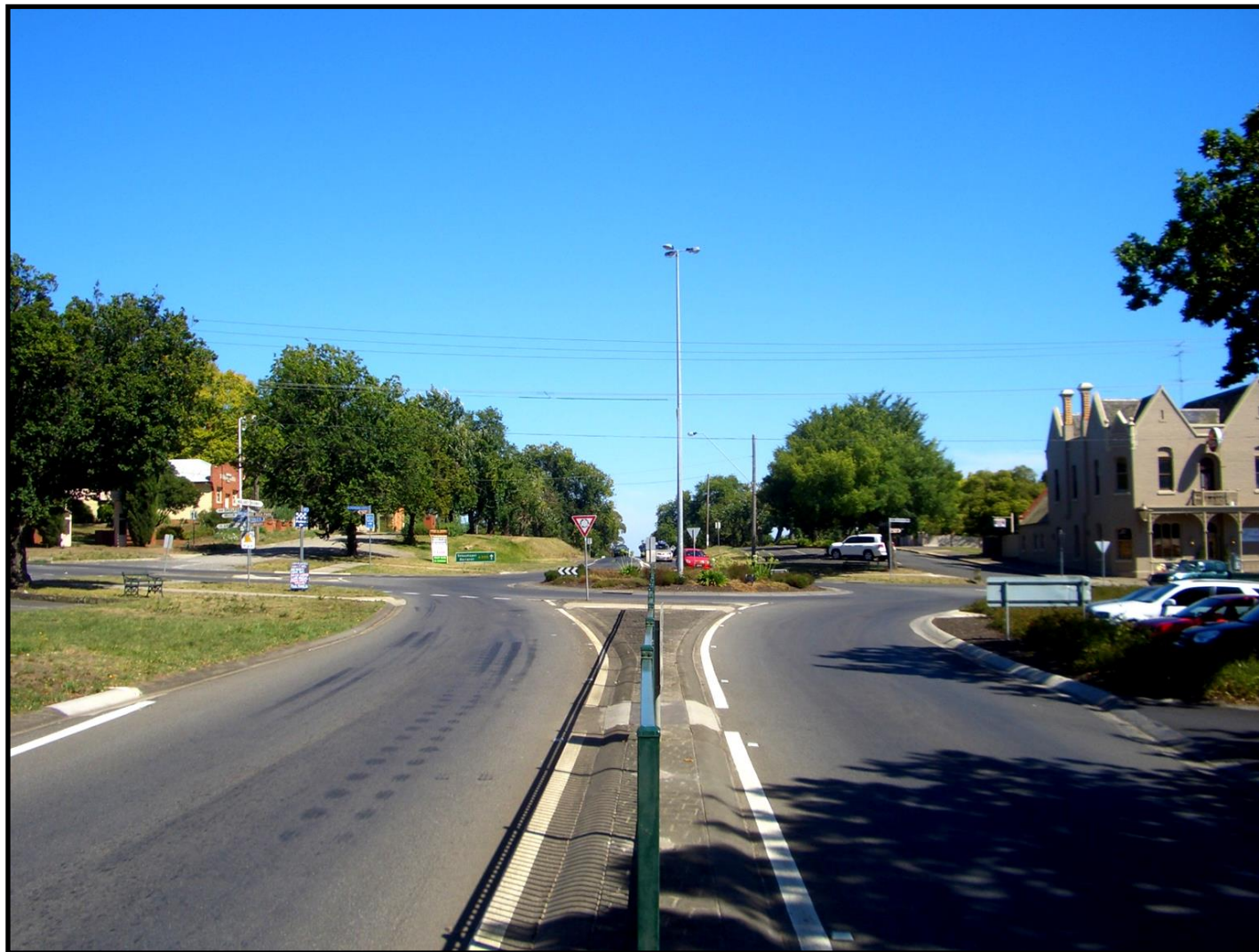
(i) View of Buninyong CBD facing west.