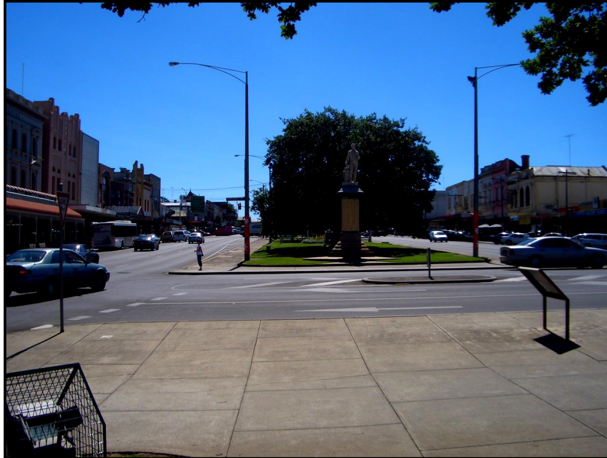
(i) Intersection of Sturt and Armstrong Streets representing the approximate centre point of the CBD Neighbourhood Safer Place.