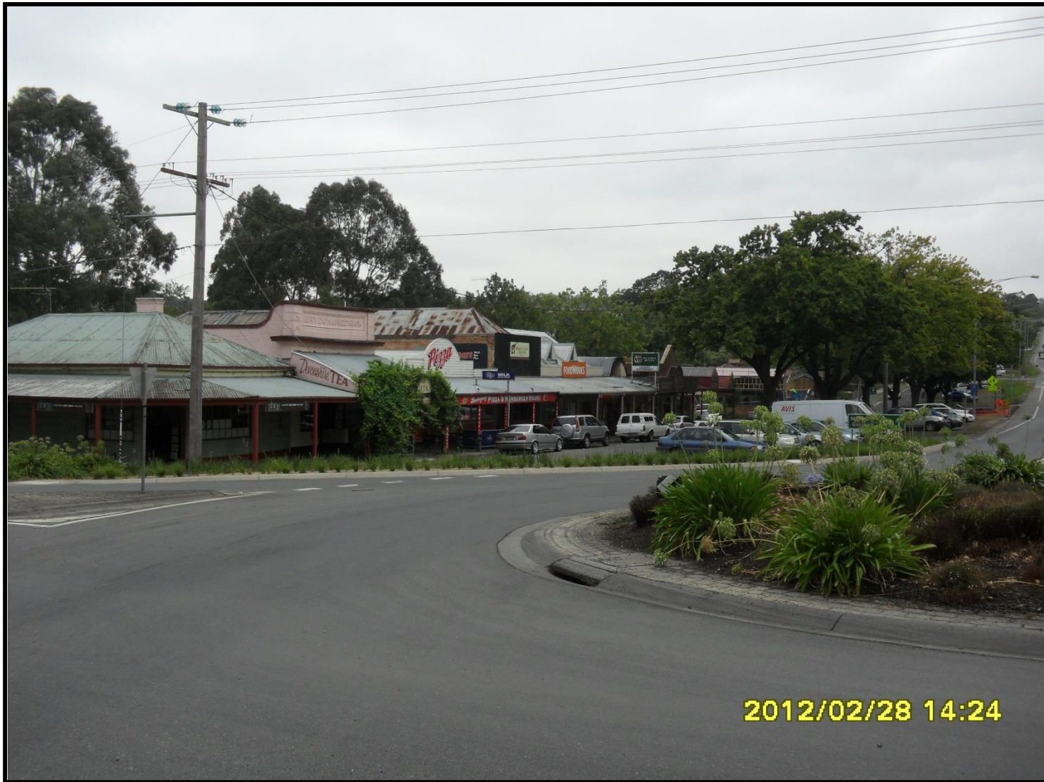
(ii) Easterly facing view of Buninyong CBD.