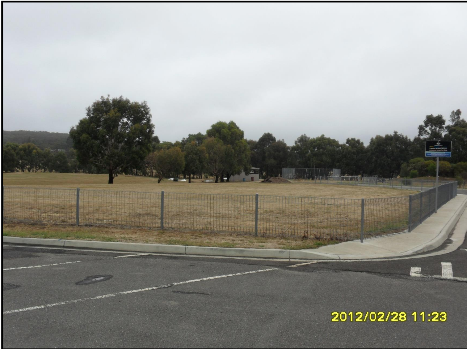
(ii) Westerly facing view of car park and reserve.