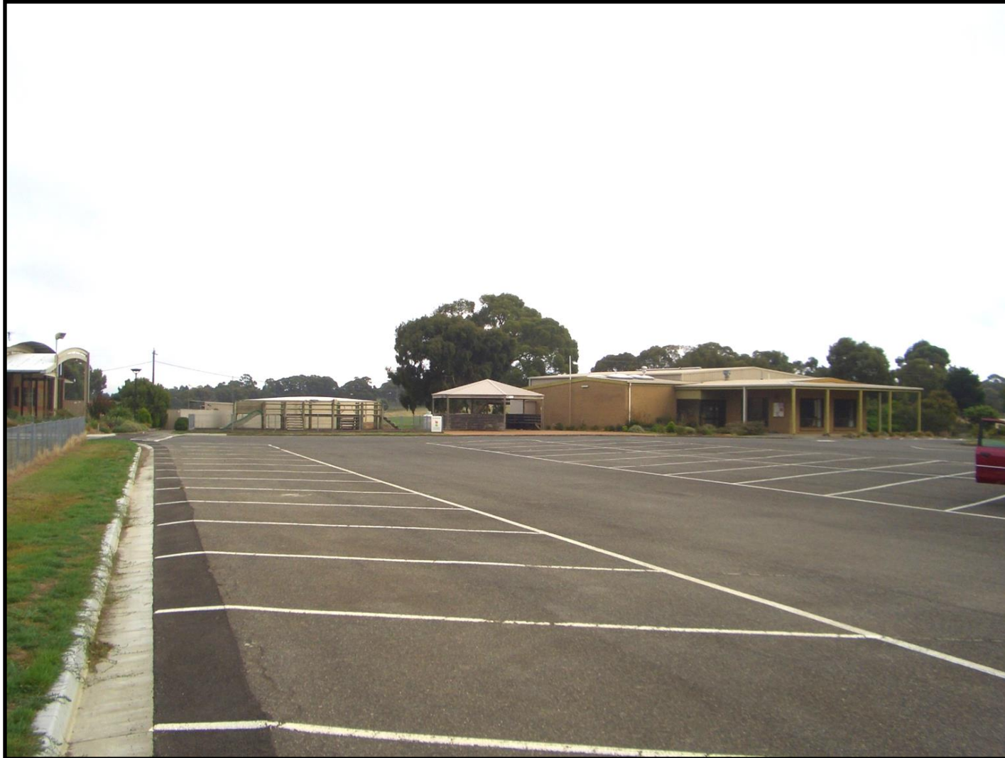
(i) Car parking area and major buildings at the Invermay Recreation Reserve.