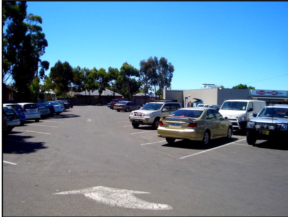
(i) Northerly facing view of rear car park at Midvale Shopping Centre.