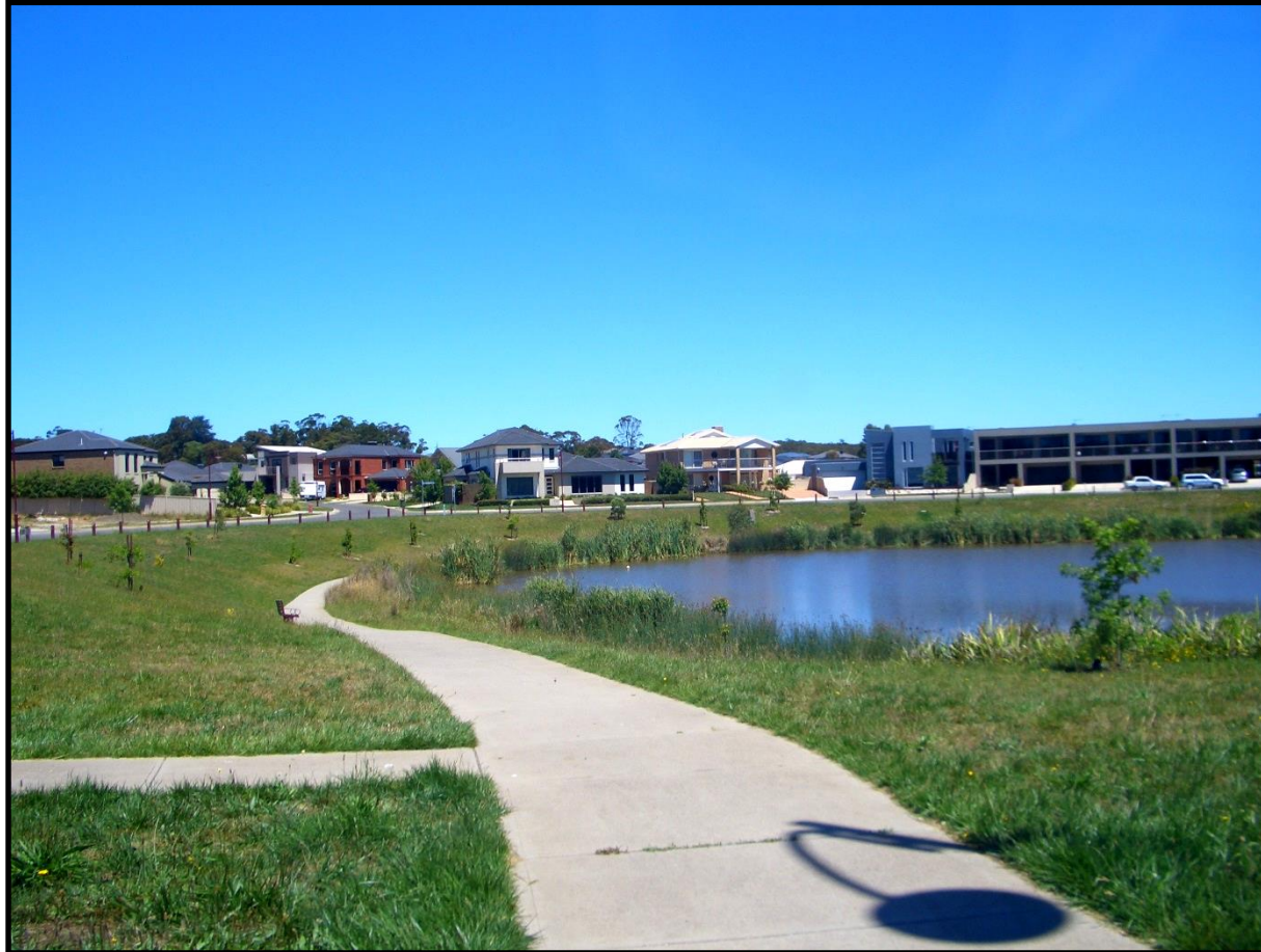
(i) Concrete walkway leading from Canadian Lakes Boulevard to sloping grassed area and lakeside.