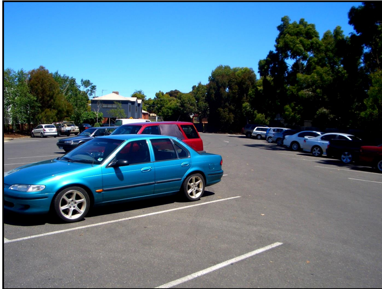
(ii) Southerly facing view of rear car park at Midvale Shopping Centre.