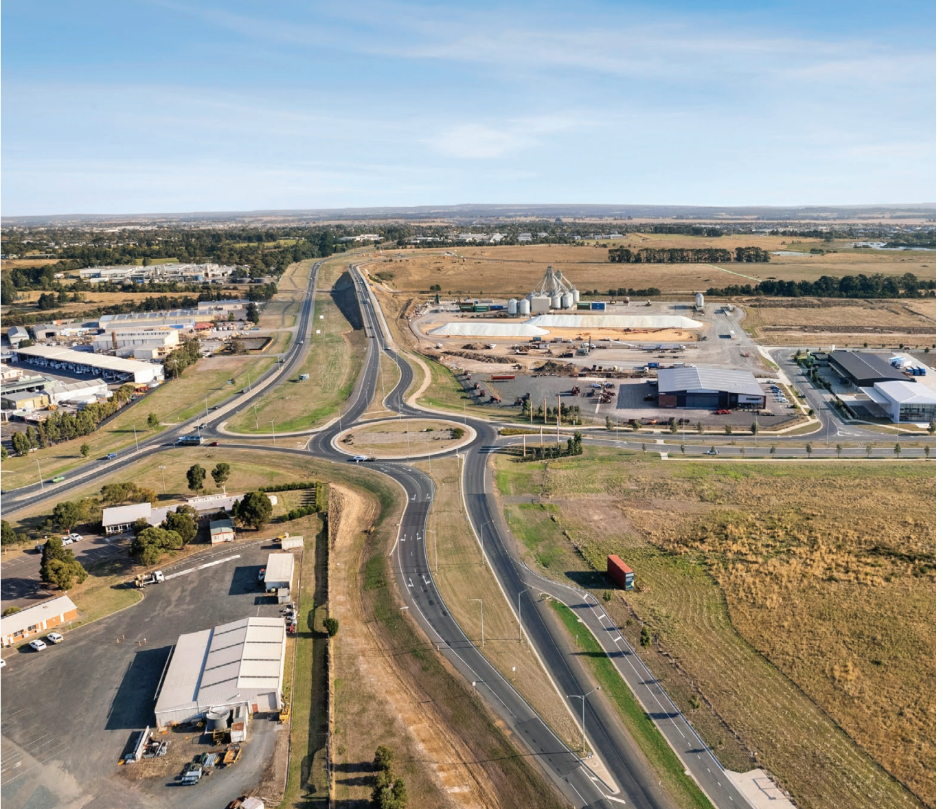
Ballarat West Employment Zone, a potential site for a regional Circular Economy Precinct to service much of the Central Highlands and Western Victoria

The facility will bring significant environmental benefits to a large part of regional Victoria as regional Local Government Areas send their recyclables to Ballarat for re-purposing and reuse.